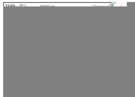
Wave Soldering (Flow Soldering)